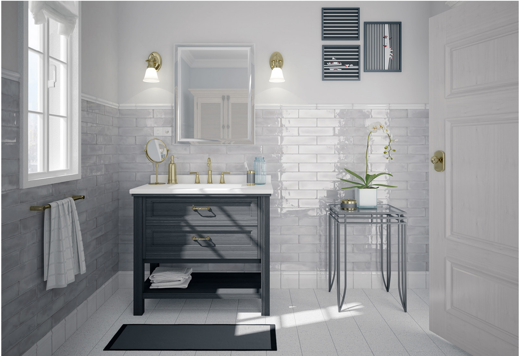
Wall: Splendours Grey Gloss 75x300mm