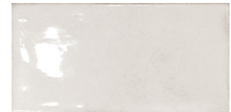
EQU0020 White Gloss 75x150MM