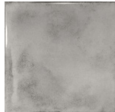
EQU0022 Grey Gloss 150x150MM