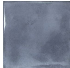
EQU0024 Blue Gloss 150x150MM