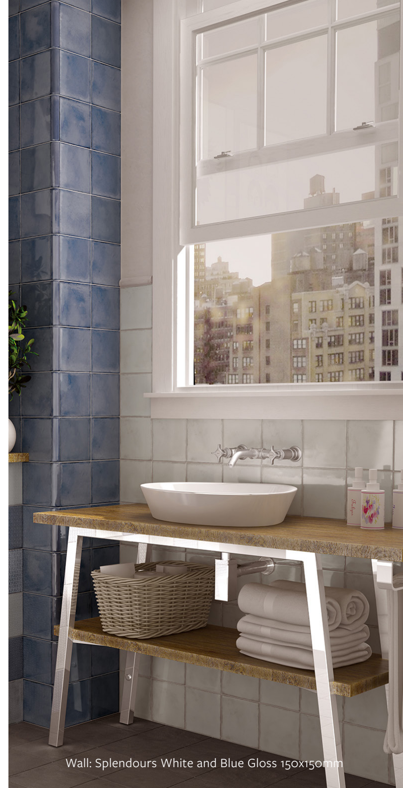
Wall: Splendours White and Blue Gloss 150x150mm