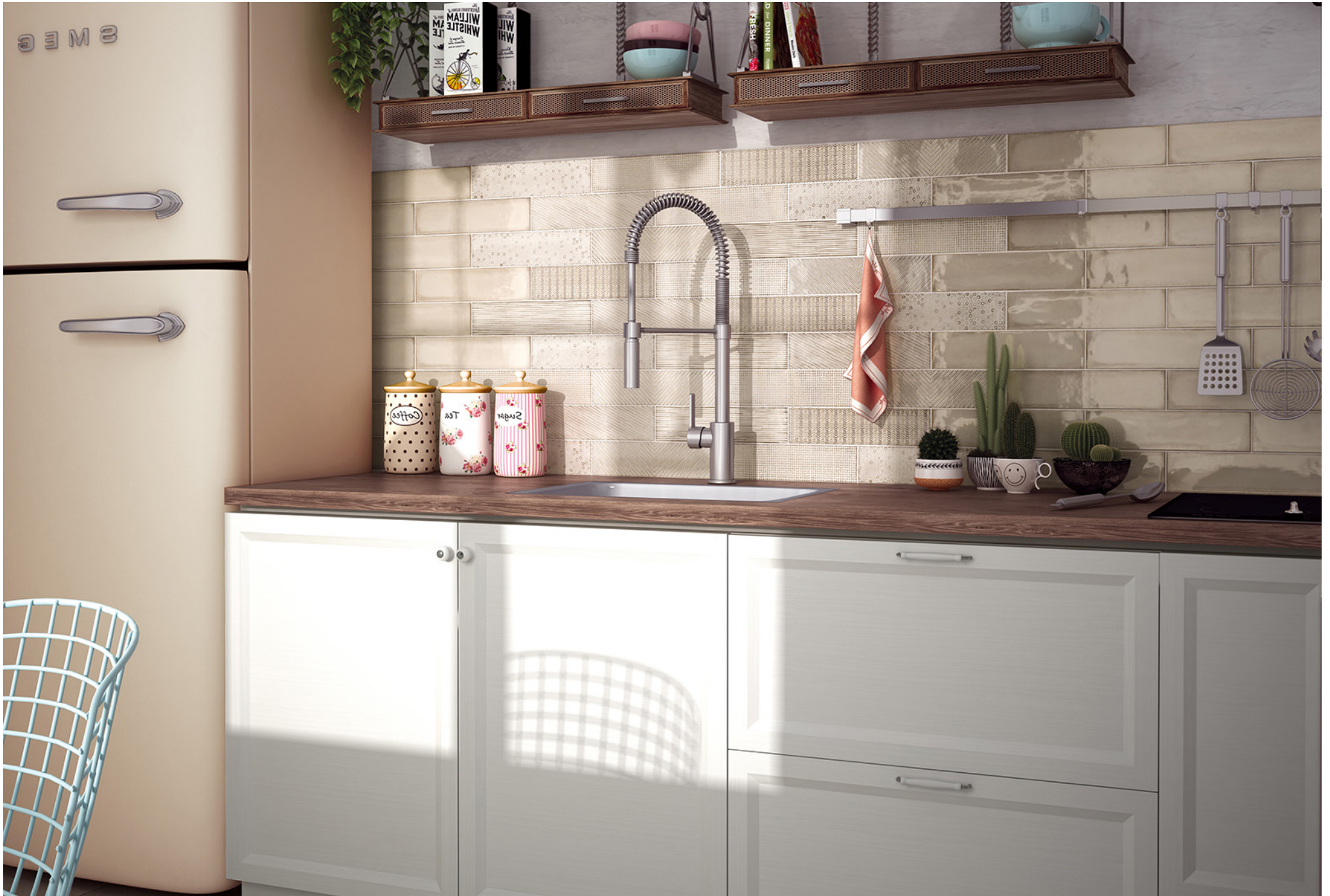
Wall: Splendour Cream Gloss 75x300mm