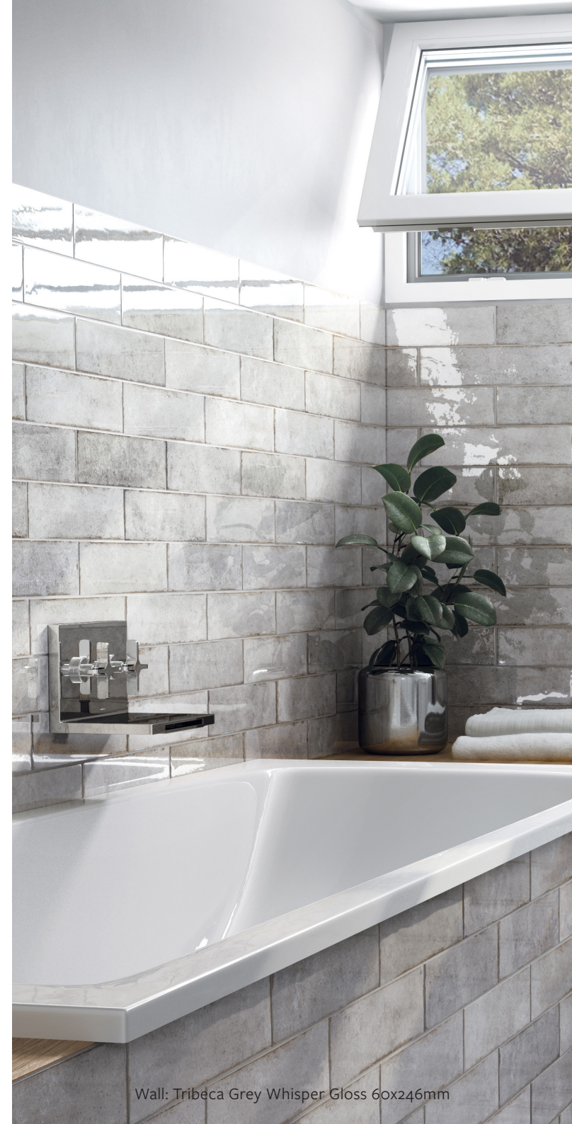
Wall: Tribeca Grey Whisper Gloss 60x246mm