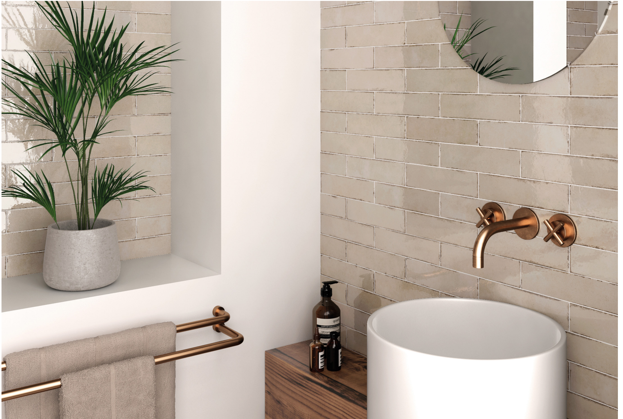
Wall: Tribeca Oatmeal Gloss 6x246mm