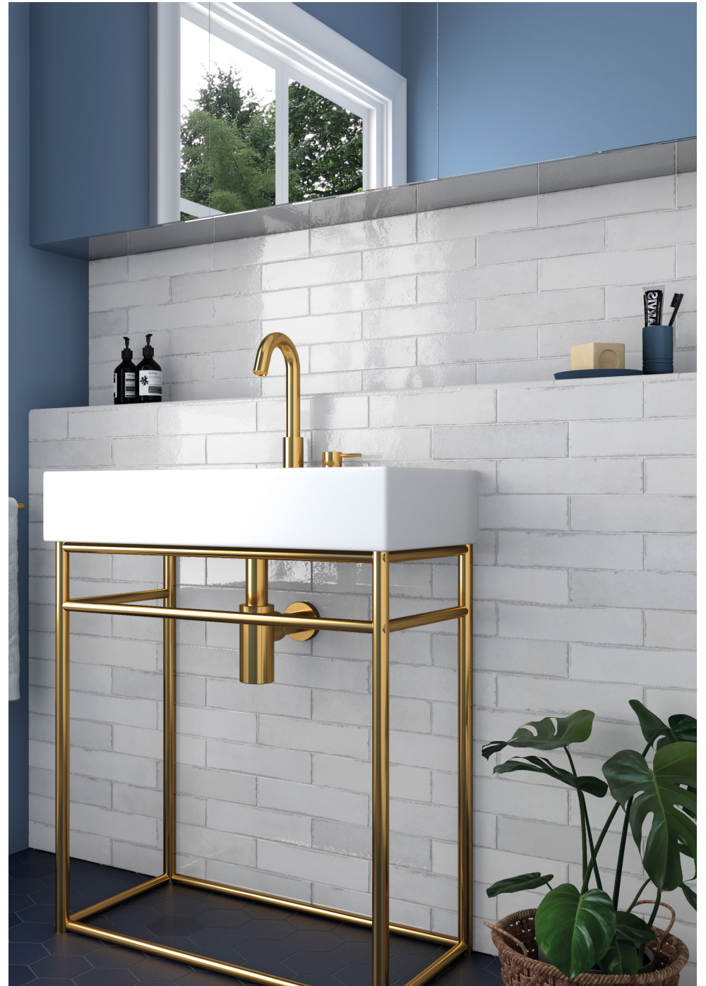
Wall: Tribeca Gypsum White Gloss 6x246mm