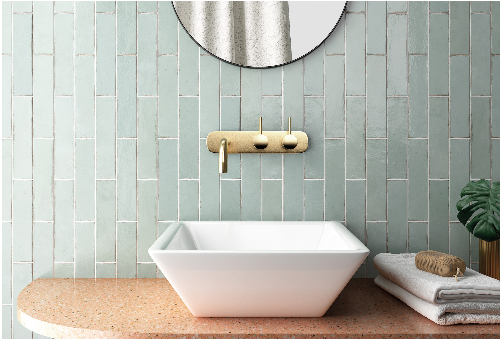
Wall: Tribeca Seaglass Mint Gloss 6x246mm