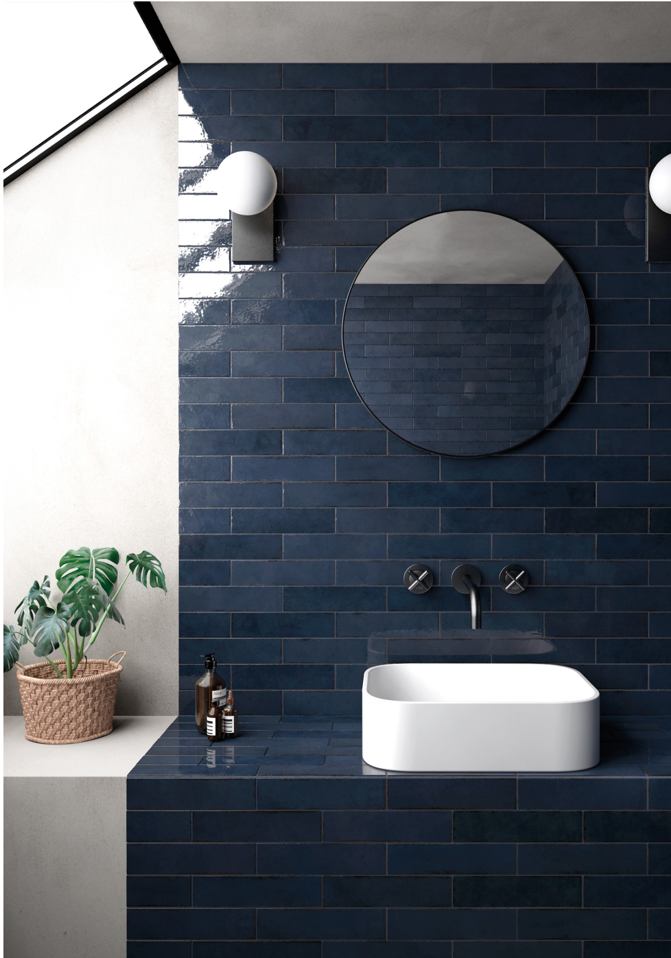
Wall: Tribeca Blue Note Gloss 60x246mm