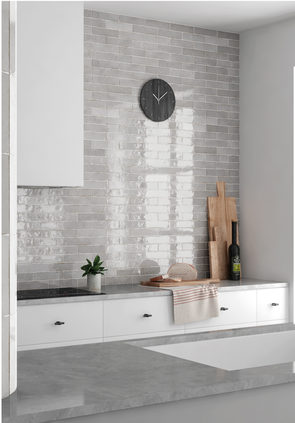
Wall: Tribeca Grey Whisper Gloss 6x246mm