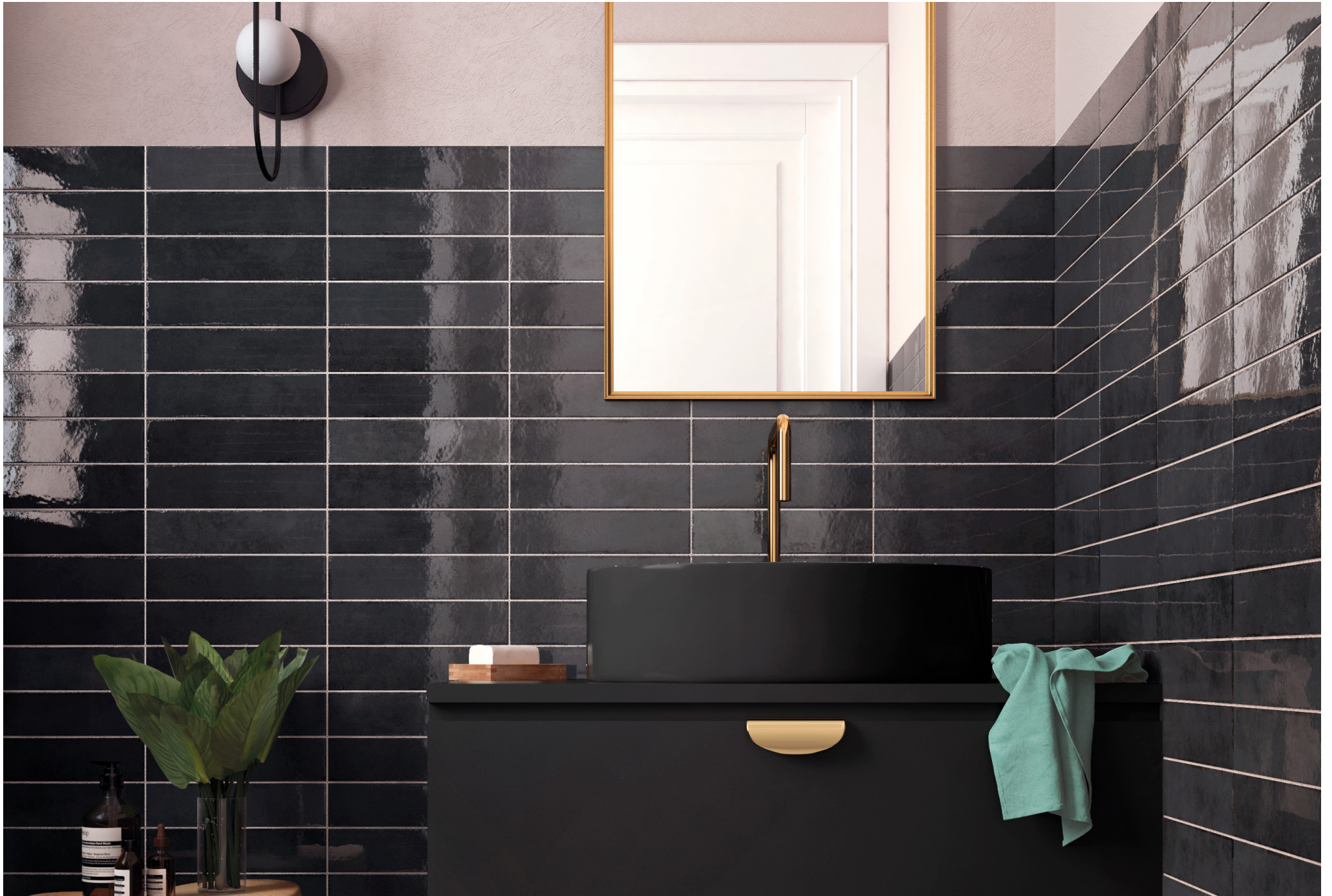
Wall: Tribeca Basalt gloss 60x246mm