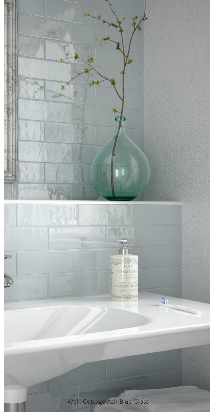
Wall: Cottage Ash Blue Gloss