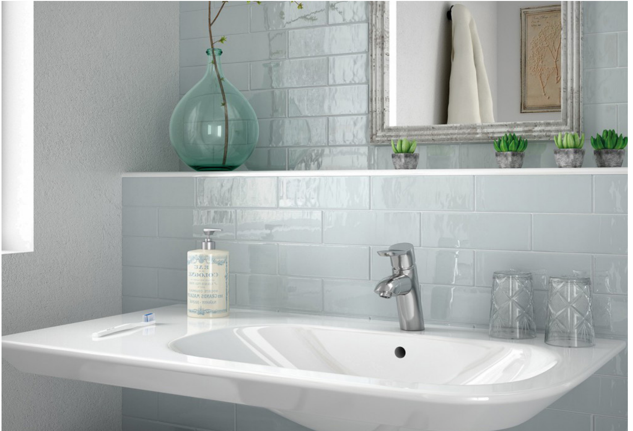
Wall: Cottage Ash Blue Gloss 75x300