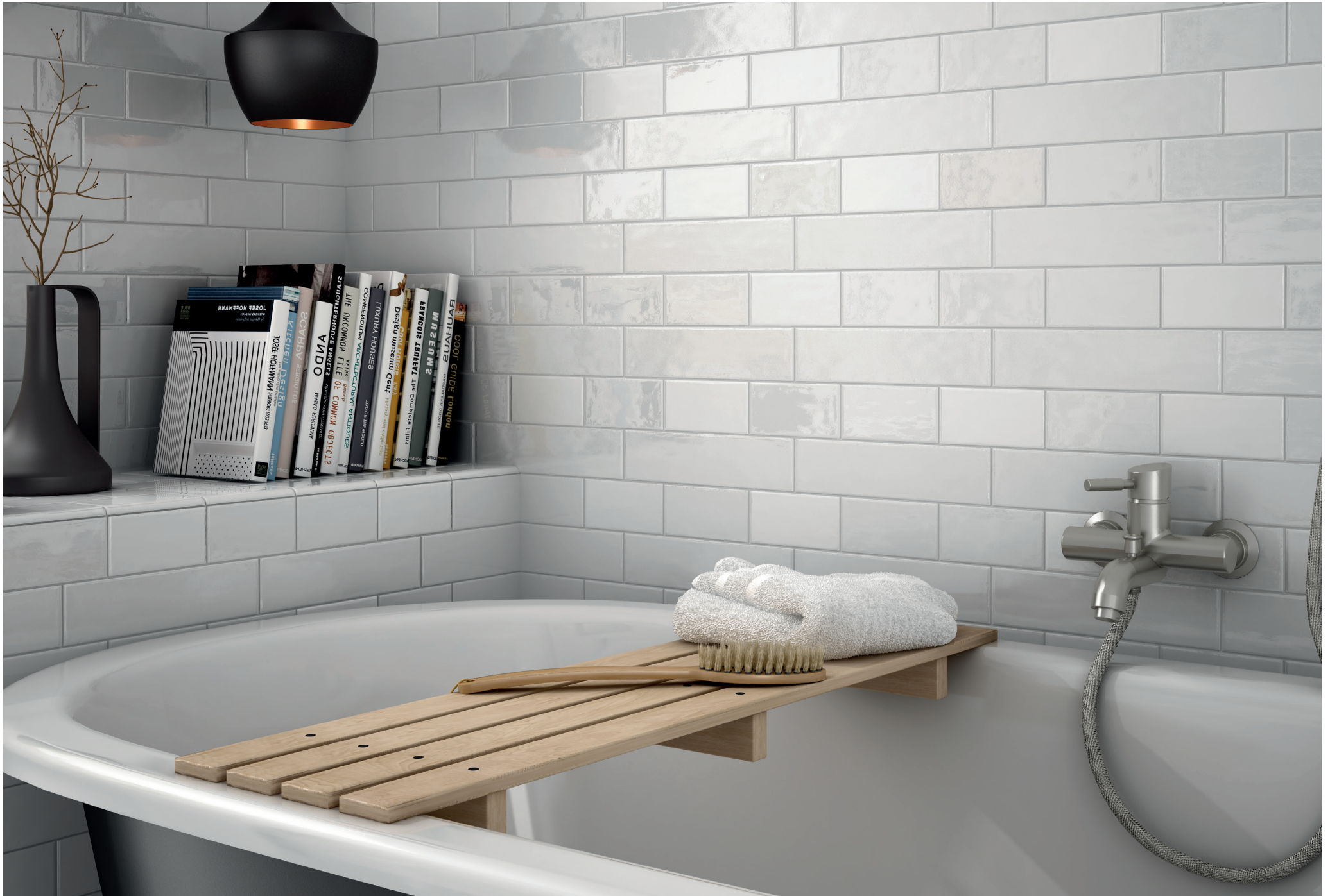
Wall: Cottage White Gloss and Matt 75x300mm