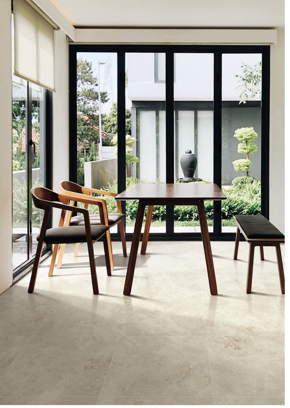
Floor: Tundra Sand Ocean External 600x600x20mm