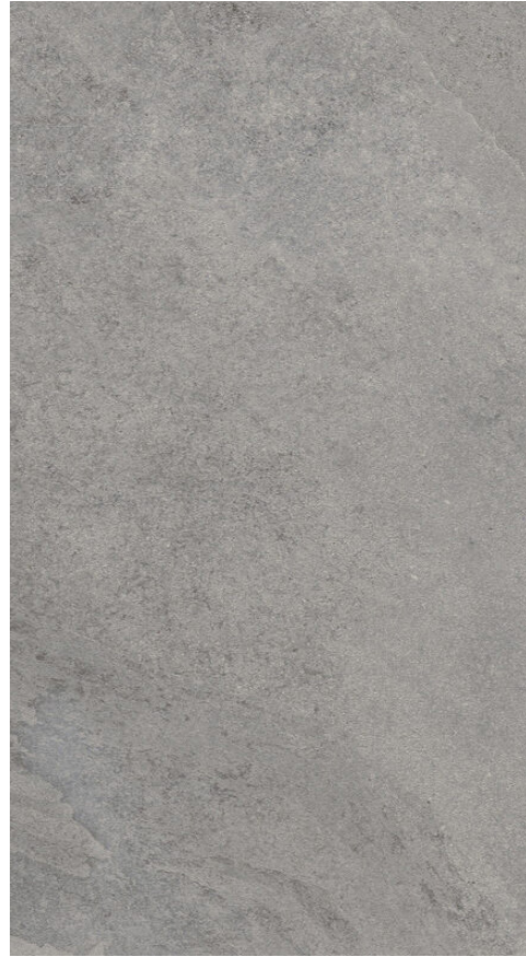
TUS0014 Mid Grey Matt 610X1222MM