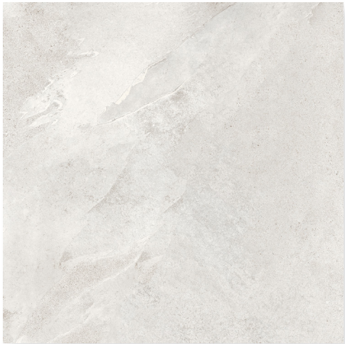
TUS0010 Ivory Matt 610x610mm