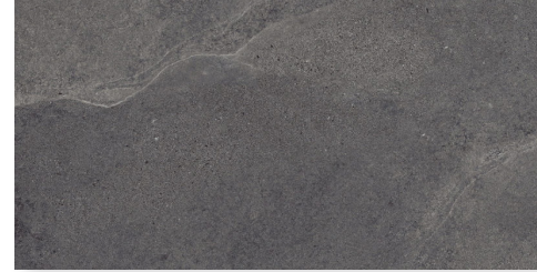
TUS0015 Dark Grey Matt 304x610mm