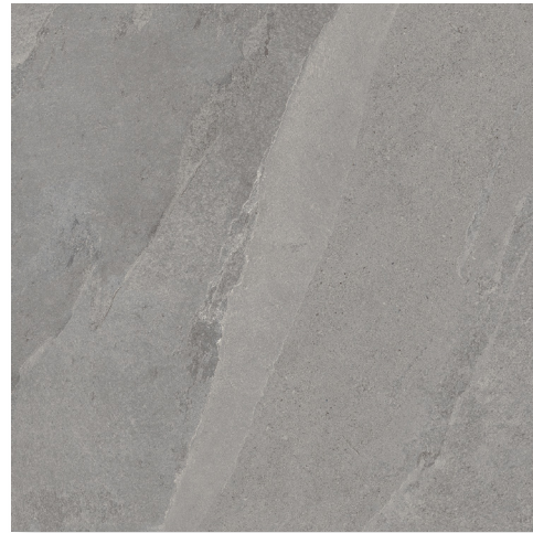
TUS0013 Mid Grey Matt 610x610mm