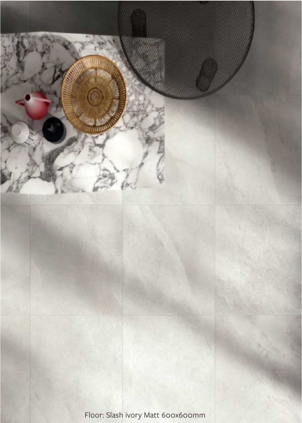
Floor: Slash ivory Matt 600x600mm