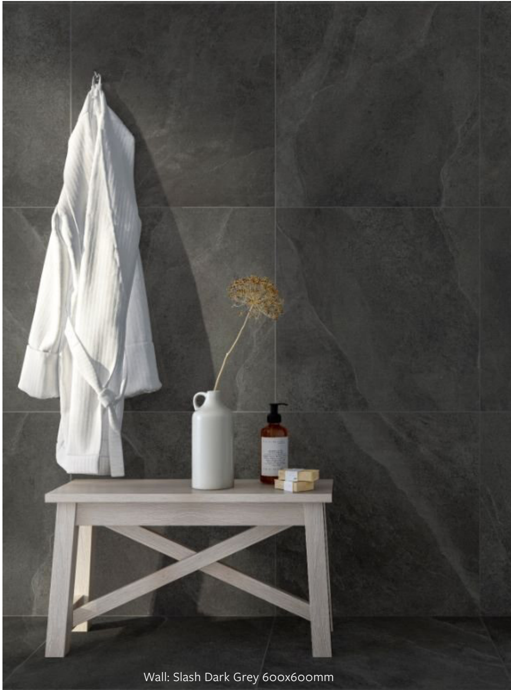
Wall: Slash Dark Grey 600x600mm