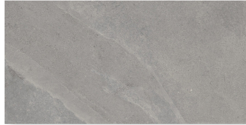
TUS0012 Mid Grey Matt 304x610mm