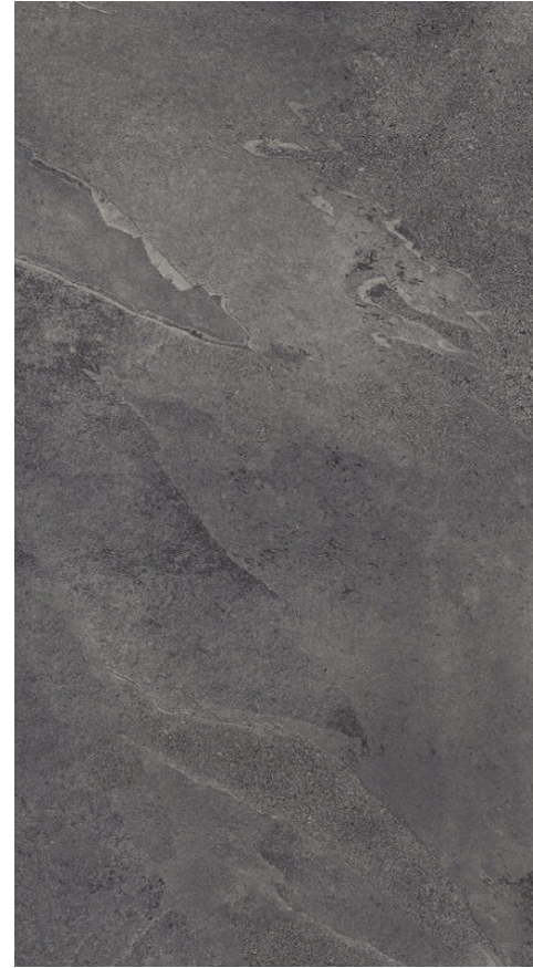
TUS0017 Dark Grey Matt 610X1222MM