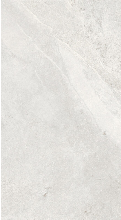
TUS0011 ivory Matt 610X1222MM