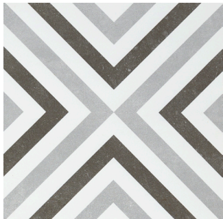
STN0030 Day & Night Elwood Matt 200x200mm