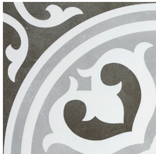
STN0032 Day & Night Brunswick Matt 200x200mm

Material: Porcelain Edge Type: Rectified Size: 200x200mm Thickness: 10mm Finish: Matt R10 Applications: Wall, Floor, Internal Made in: Spain