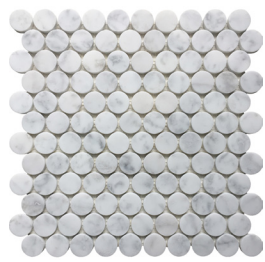
8558 Penny Round Honed Bianco Carrara 30mm on 303x280mm