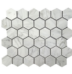
8556 Italian Carrara Hexagonal Honed 47x55 on 275x328mm