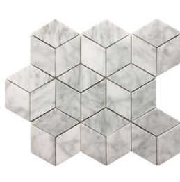
8549 Italian Carrara Cube Honed 48x54 on 295x260mm