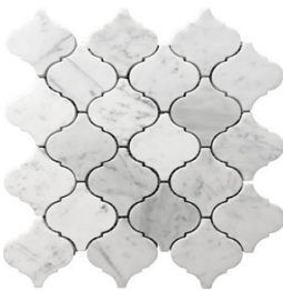
8544-LIGHT Italian Carrara Lantern Honed (Light Shade) 75x78 on 285x265mm