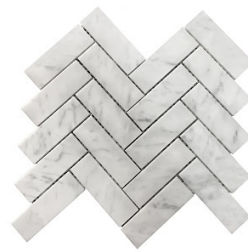
8542 Italian Carrara Large Herringbone Honed 35x110 on 265x320mm