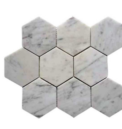
8557 (Coming Soon) Italian Carrara Honed Hexagonal 96x96 on 253x292mm