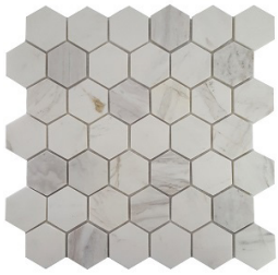
8531 Bianco Carrara Hexagonal Polished 48x48 on 265x305mm