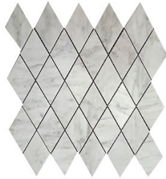
8535 Italian Carrara Diamond Polished 48x48 on 300x285mm