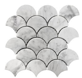
8543 Italian Carrara Fanned Honed 67x78 on 237x243mm