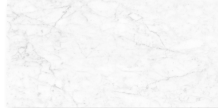
ESTo118 Carrara Venato Honed 300x600mm