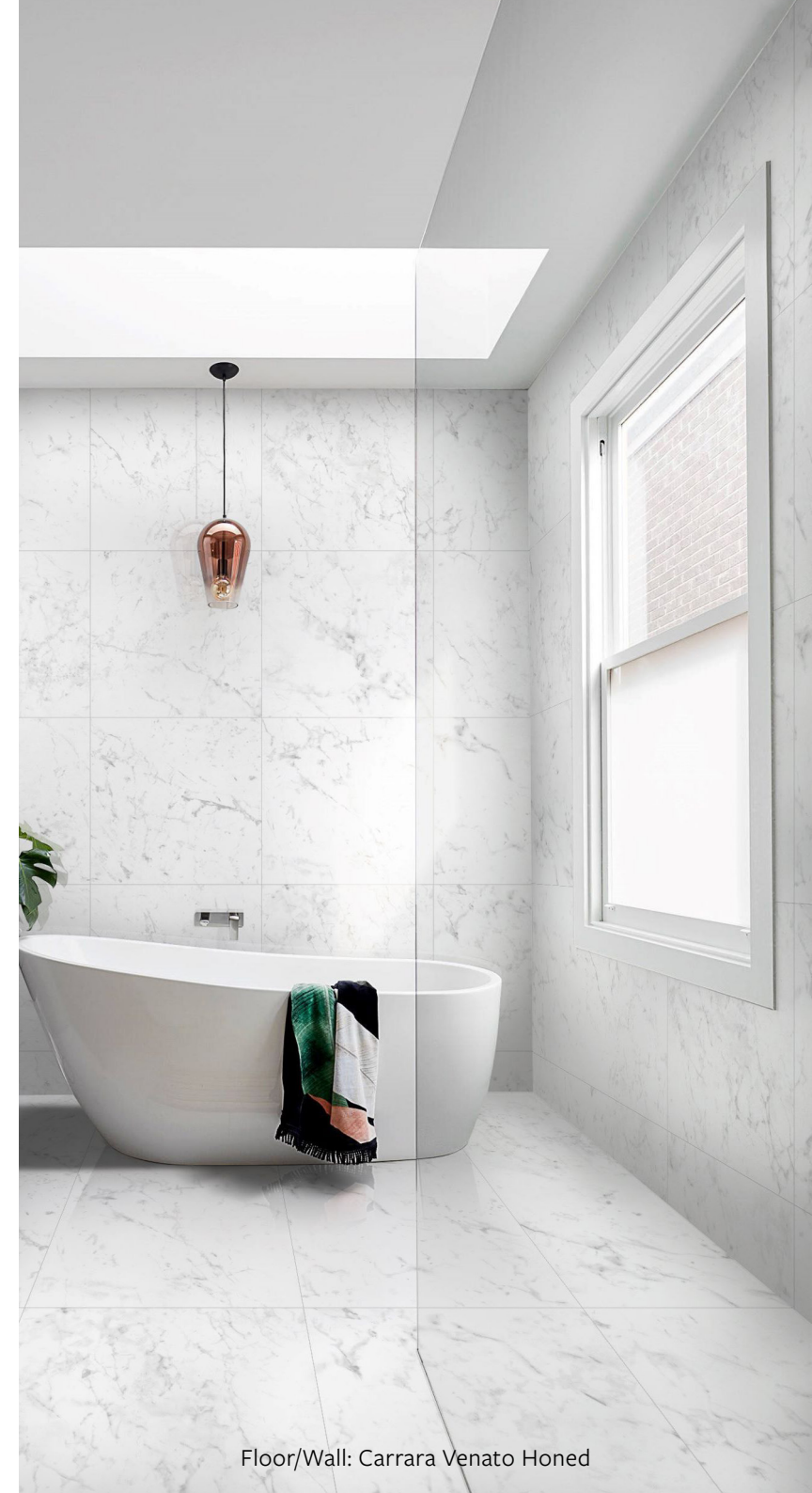
Floor/Wall: Carrara Venato Honed