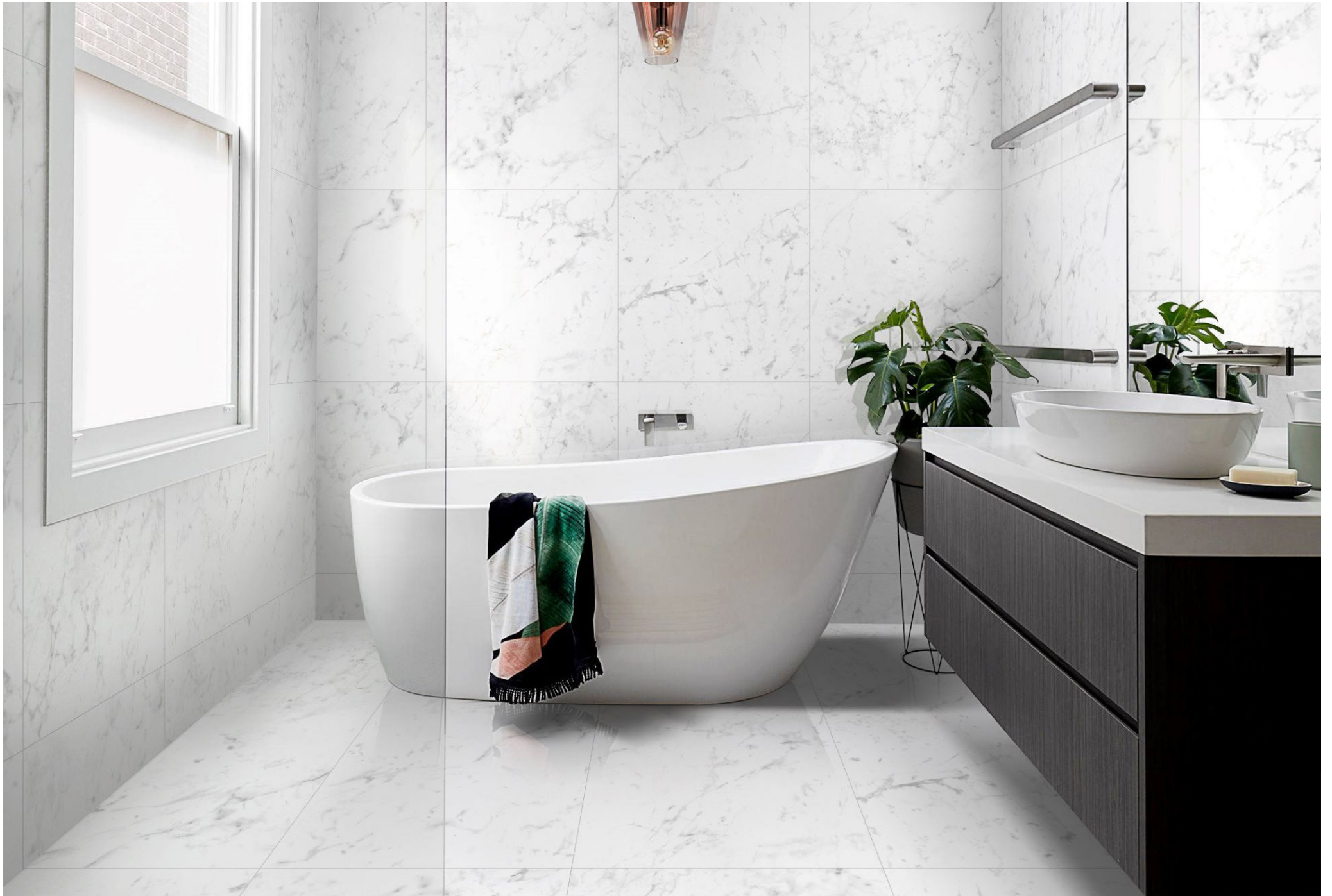
Floor/Wall: Carrara Venato Honed