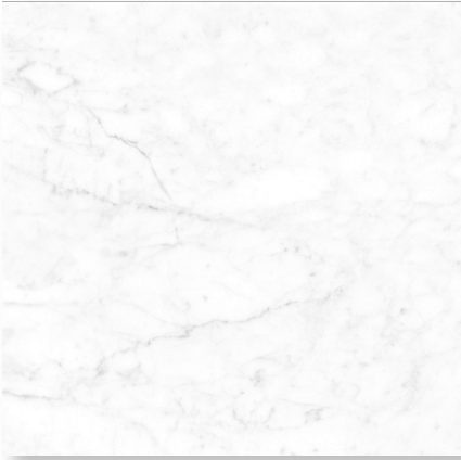
ESTo107 Carrara Venato Polished 600x600mm