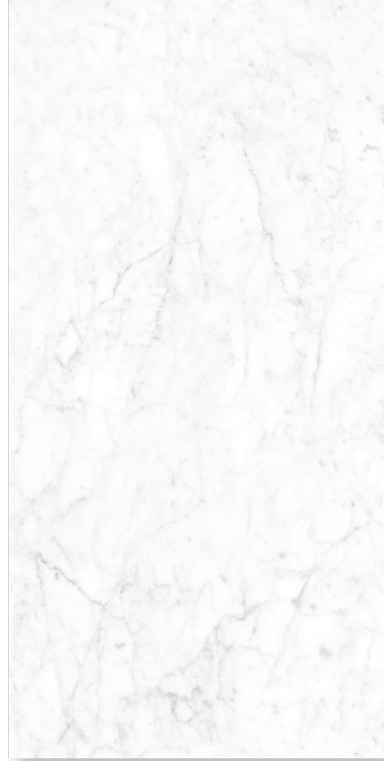
ESTo109 Carrara Venato Polished 600x1200mm