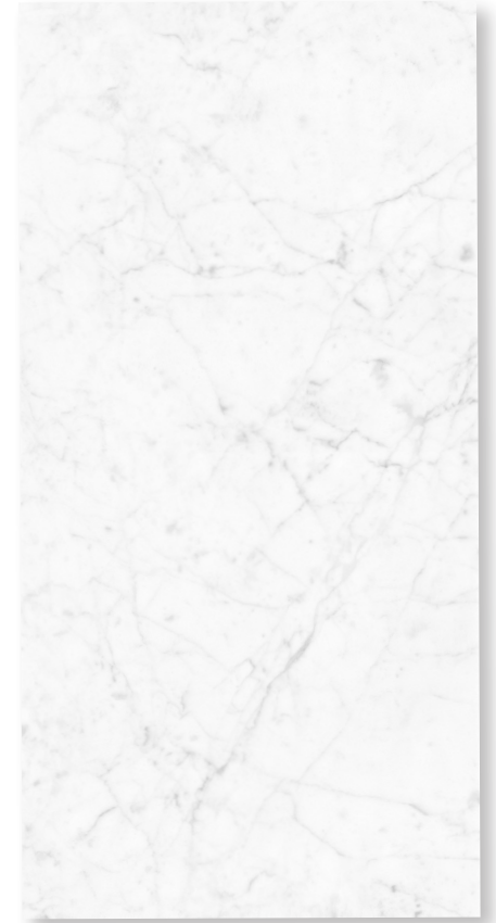
ESTo110 Carrara Venato Honed 600x1200mm