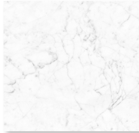
ESTo108 Carrara Venato Polished 600x600mm