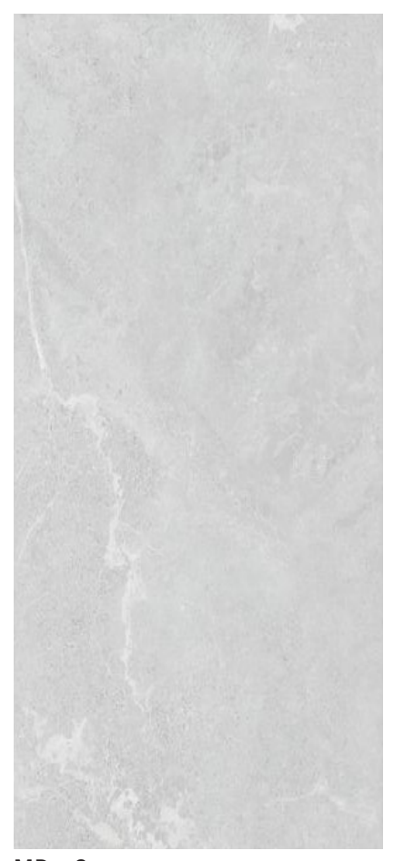
MPo183 Marmi Grande Wales Castle Matt 750x1500mm 8 Faces