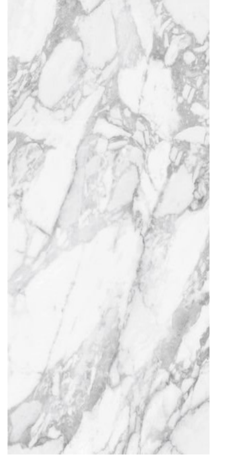
DSS0166 Marmi Grande Arabescato Polished 750x1500mm 6 Faces