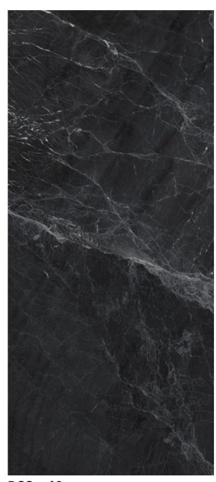
DSS0168 Marmi Grande Marquina Polished 750x1500mm 6 Faces