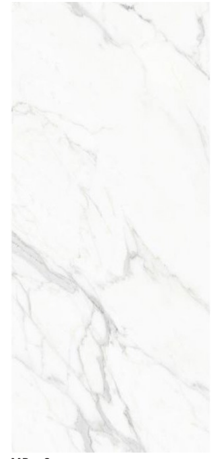
MPo184 Marmi Grande Statuario Polished 750x1500mm 8 Faces