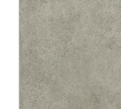
EST0022 T-Stone Grey Matt 600x600mm 6 Faces