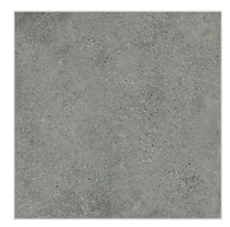
EST0024 T-Stone Ash Grey Matt 600x600mm 6 Faces