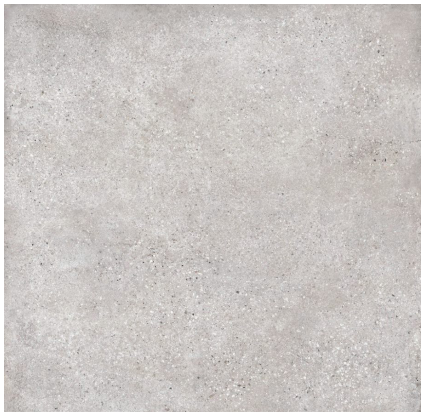
EST0021 T-Stone Light Grey 600x600mm 6 Faces