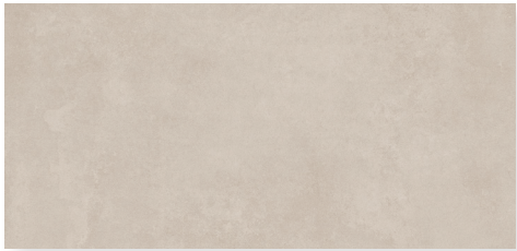
DS0178 Cream Matt P3 300x600mm