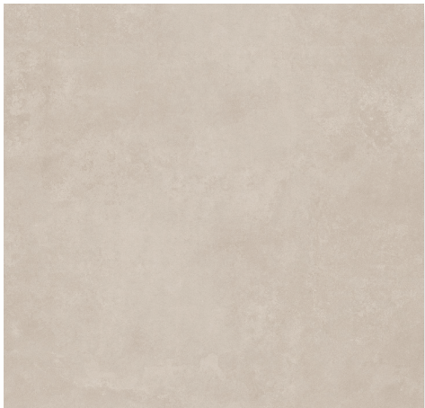
DS0179 Cream Matt P3 600x600mm