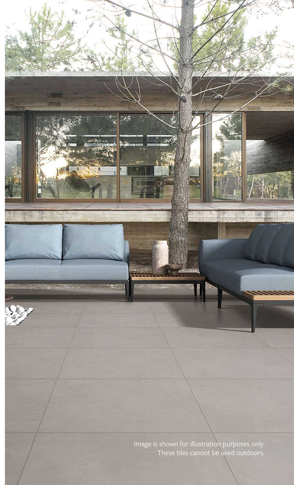
Image is shown for illustration purposes only. These tiles cannot be used outdoors.