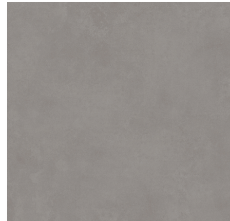
DS0183 Grey Matt P3 600x600mm