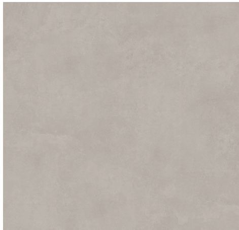
DS0181 Pearl Matt P3 600x600mm