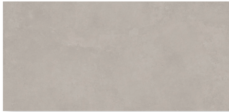
DS0180 Pearl Matt P3 300x600mm