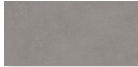
DS0182 Grey Matt P3 300x600mm