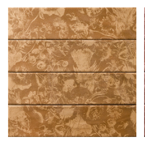
PAMoo29 Gold Flos Matt Feature 75X300MM