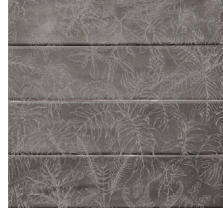
PAMoo35 Silver Flos Matt Feature 75X300MM