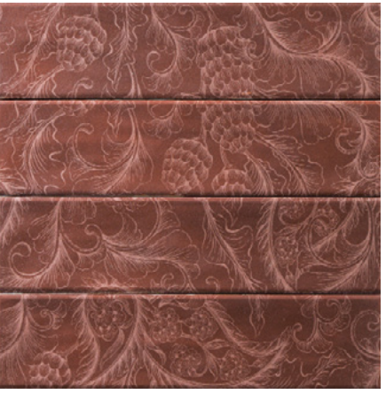
PAMoo31 Rose Gold Flos Matt Feature 75X300MM