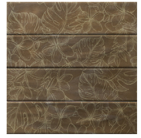
PAMoo33 Brass Flos Matt Feature 75X300MM