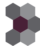
QUA0129 Light Grey Polished 600x600mm