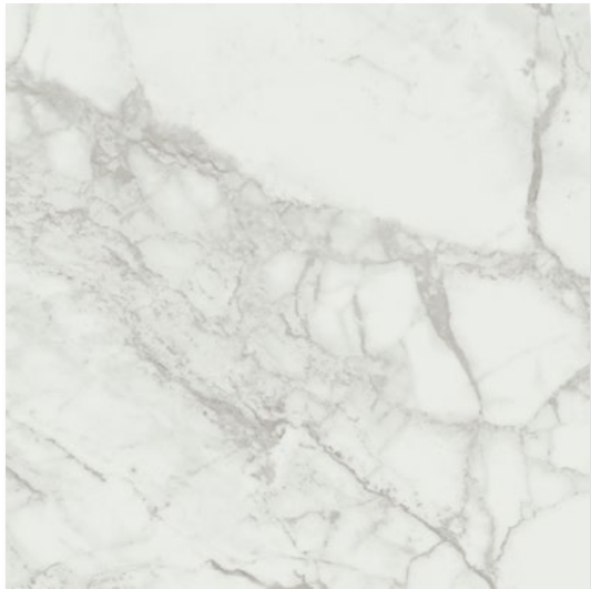
PAM0023 Luni Blanco Satin 600x600mm