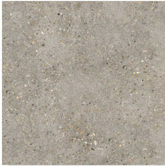
DS0154 Beige Matt P5/R10 300x600mm