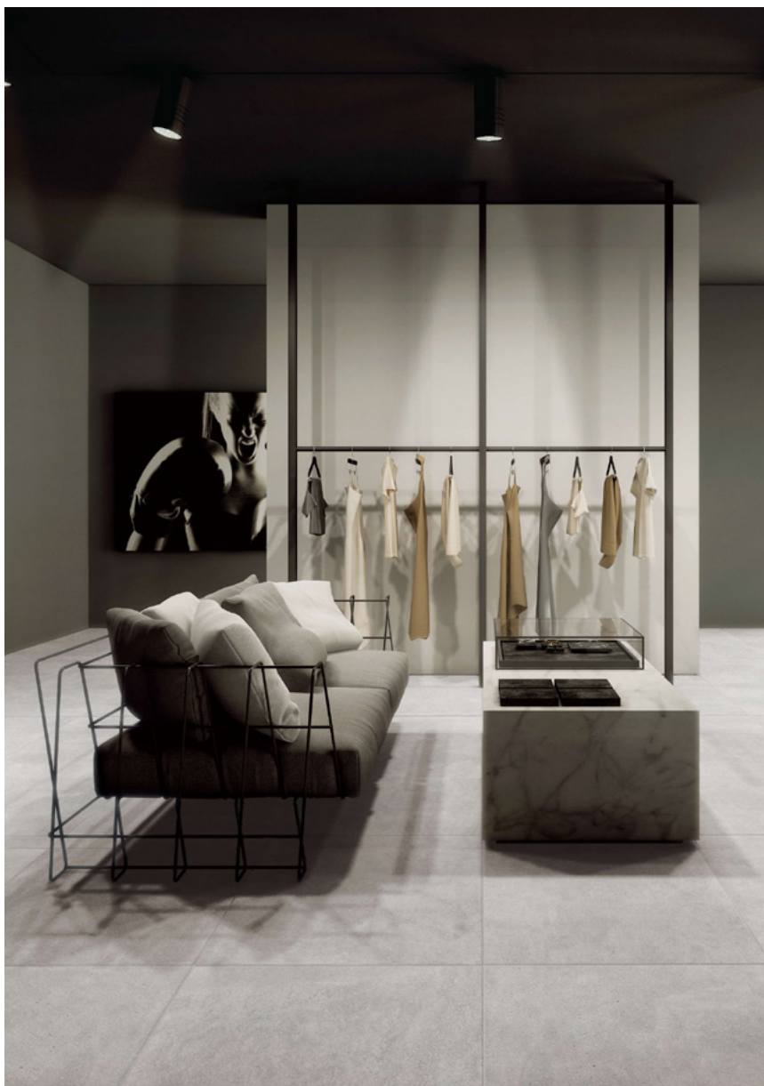
Floor: Q-Stone Bianco