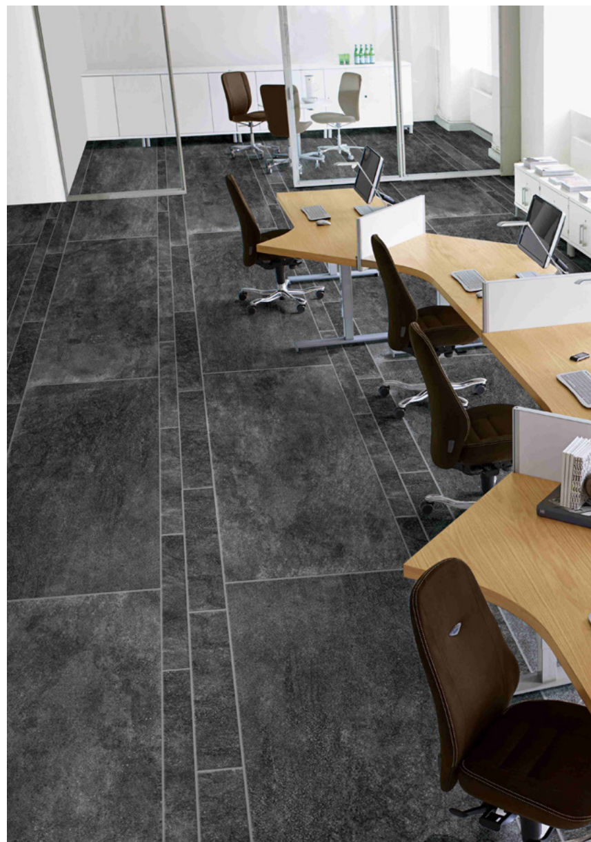
Floor: Q-Stone Black