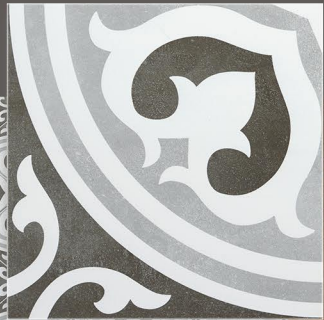
STN0032 03 BRUNSWICK

200X200MM ENCAUSTIC PORCELAIN TILES MATT FINISH | R9 SLIP RATING RECTIFIED | MADE IN SPAIN