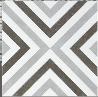
STN0030 01 ELWOOD