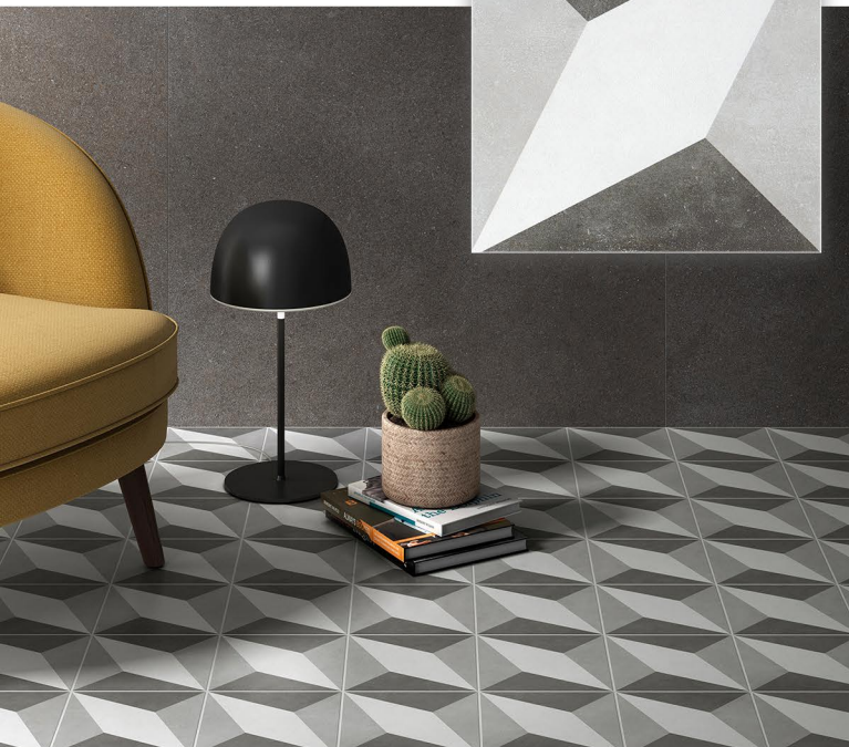
STN0028 03 CUBE

200X200MM ENCAUSTIC PORCELAIN TILES MATT FINISH | R9 SLIP RATING RECTIFIED | MADE IN SPAIN