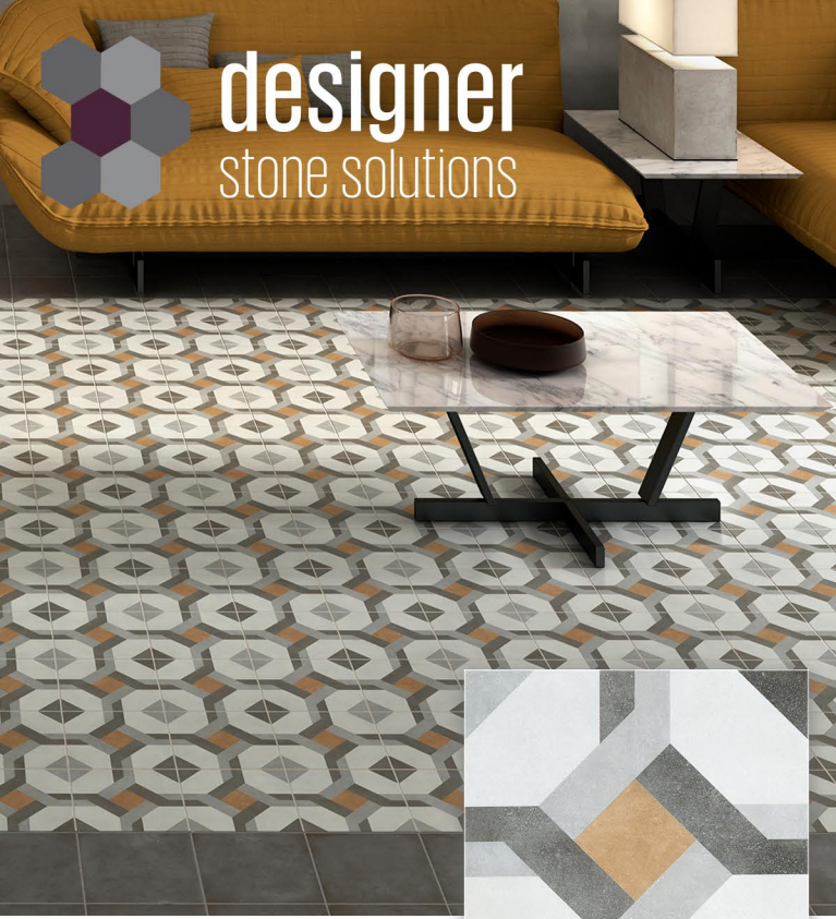
STN0026 01 DIAMOND